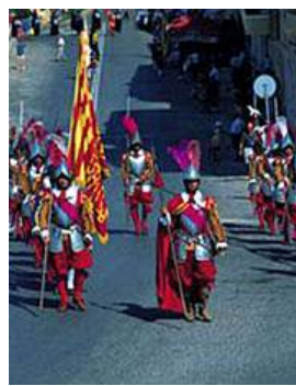
One of Malta's many festivals – celebrating 7,000 years of culture on the island of Gozo.

Feb 3 - Feb 8: Carnival Mar 10 - 13: Mediterranean Food Festival Mar 20 - 27: Holy Week May 6 - 7: Fireworks Festival July 15 - 17: Jazz Festival Sep 24 - 25: Malta International Airshow Oct 6 - Oct 16: The Malta Historic Cities Festival Oct 22 - 29: The Rolex Middle Sea Race Nov 7 - 11: International Choir Festival