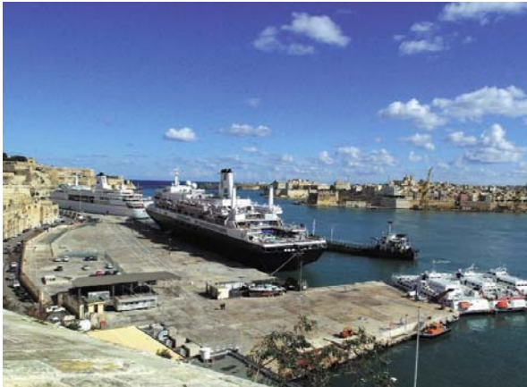
Cruise liners in the Grand Harbour of Valletta.

Phoenicians, Carthaginians and Romans left their traces, to be followed by Arabs and Normans. The Knights of the order of St John made the island their headquarters from the 16 th century and built great fortifications, palaces, public buildings and St John's Cathedral with its eight ornate chapels dedicated to each of the lingues or nations of the Order.